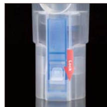
Lock on – continuing mode