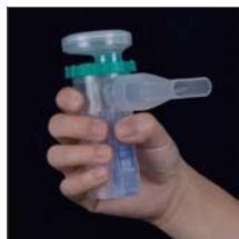
Ergonomic bottle design